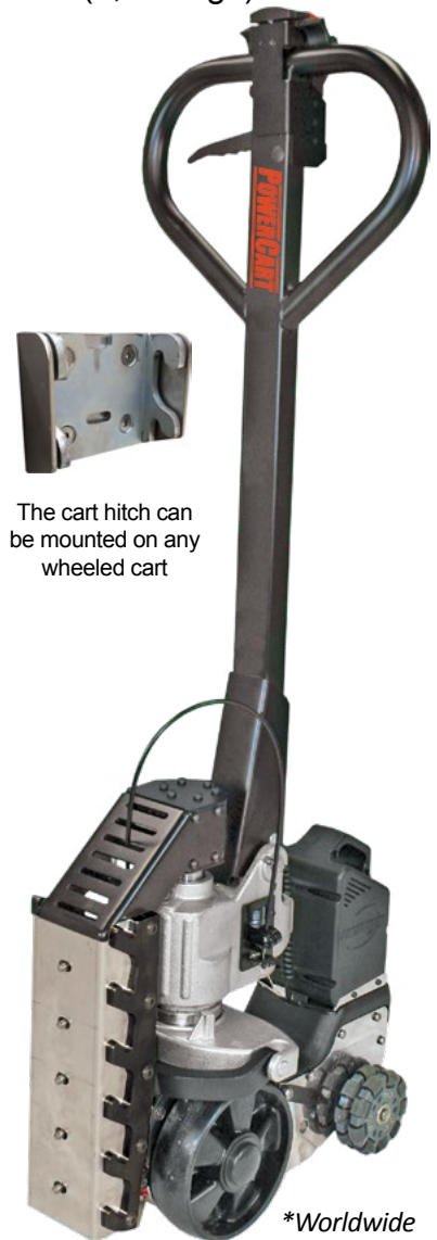
The cart hitch can be mounted on any wheeled cart

SAFER TO USE: A unique feature of the PCH is its automatic pin locking system that ensures a secure connection between cart and mover. A spring-loaded pin locks the PCH's hitch to the cart's hitch preventing the two from separating - regardless of the terrain or use case. The locking pin is also automatically retracted when the cart is unhitched.