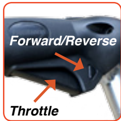
Model Shown: RGB40SP

User designed grip with forward/reverse and smooth trigger, engineered for easy operation.