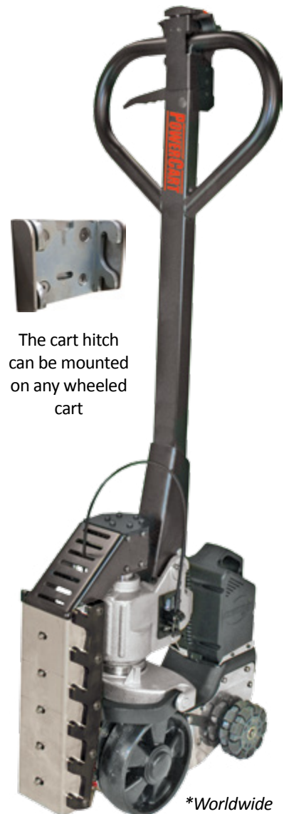
The cart hitch can be mounted on any wheeled cart

SAFER TO USE: A unique feature of the PCH is its automatic pin locking system that ensures a secure connection between cart and mover. A spring-loaded pin locks the PCH's hitch to the cart's hitch preventing the two from separating - regardless of the terrain or use case. The locking pin is also automatically retracted when the cart is unhitched.